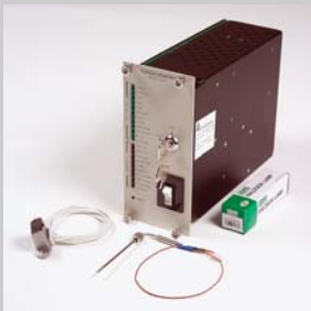
5600 Model Torch Controller