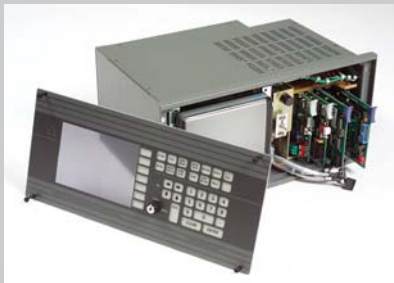
7355 DDC System Controller